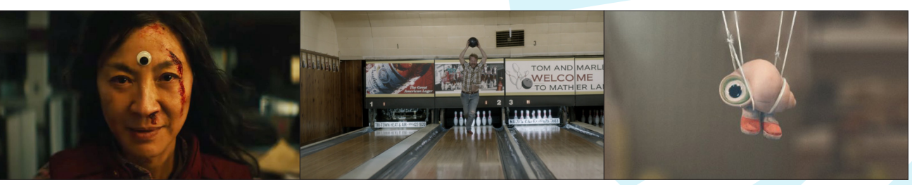
Everything Everywhere All at Once

Small Town Wisconsin (including its theatrical premiere at a gala red carpet event!)